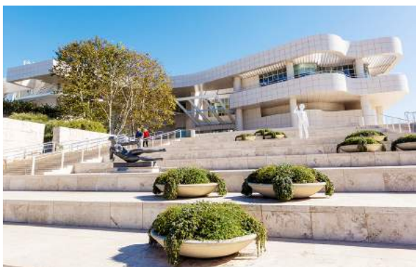
The Getty Center