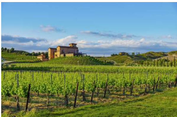
Temecula Valley Wine Country